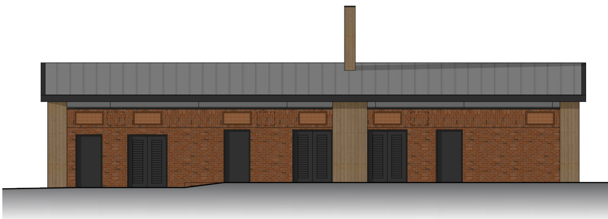
West Elevation 1:100@A2