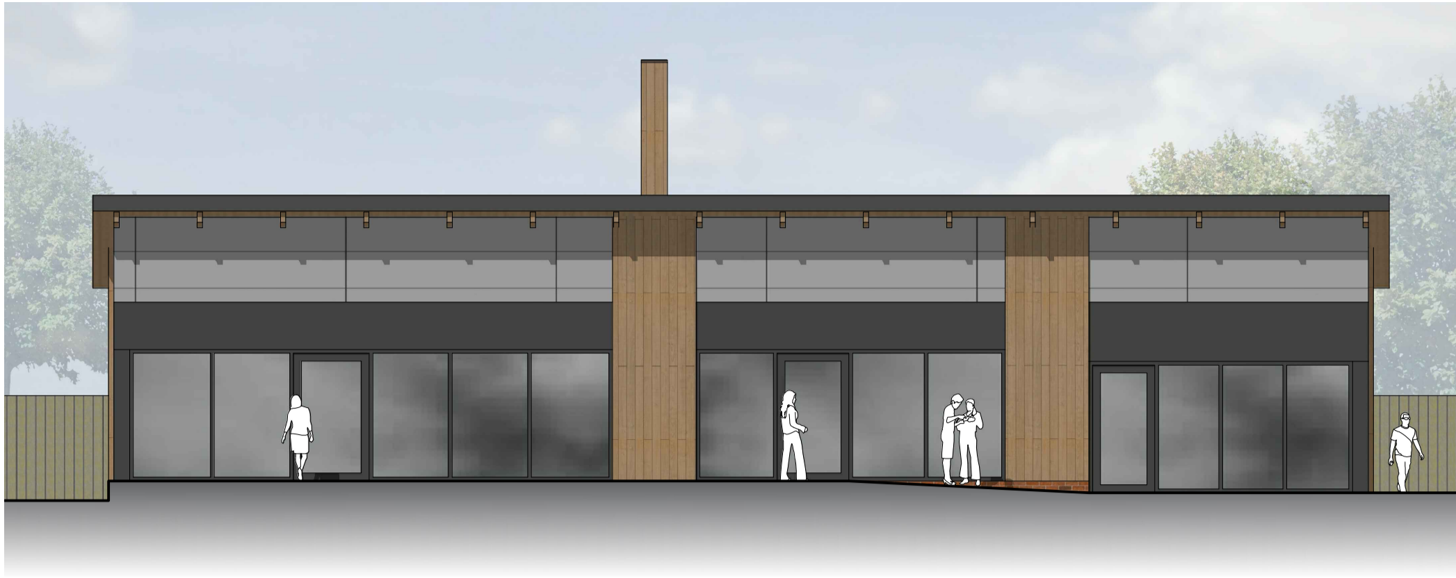
East Elevation 1:100@A2