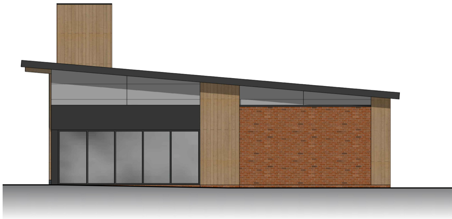
North Elevation 1:100@A2