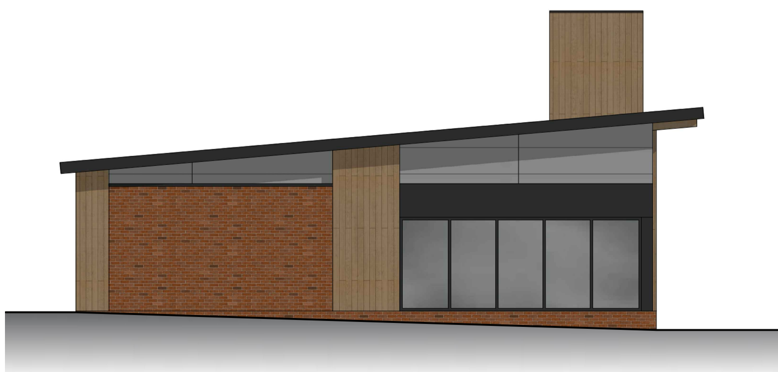
South Elevation 1:100@A2